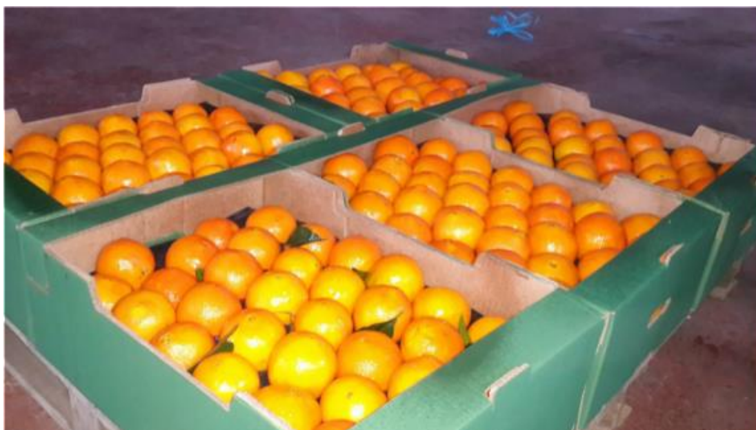
Products of the company.